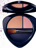
Blush Duo 03