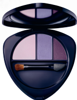
Eyeshadow Trio 03