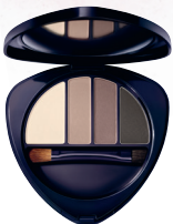
Eye & Brow Palette